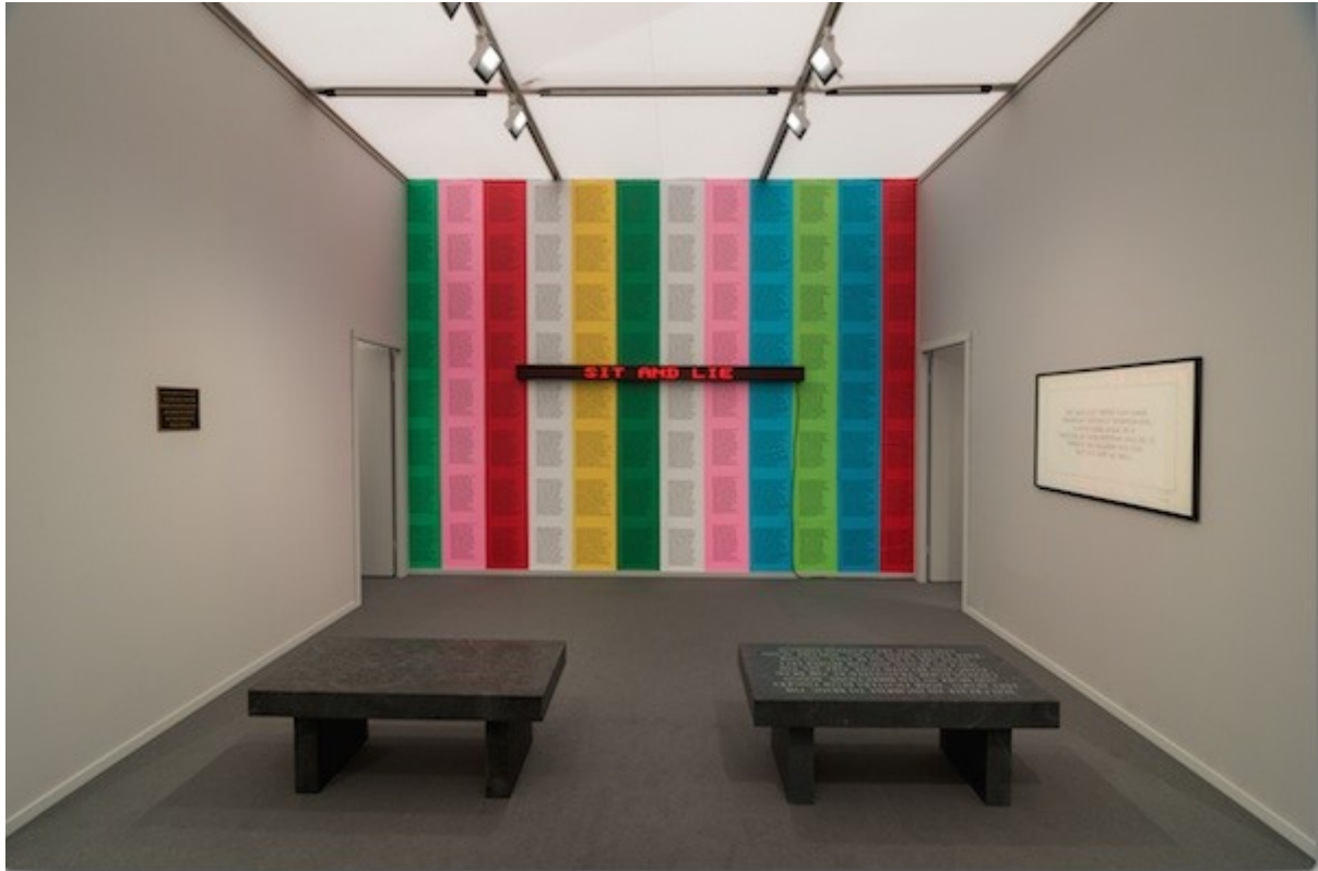
Sprüth Magers, Frieze Masters 2015, Booth F12, installation view