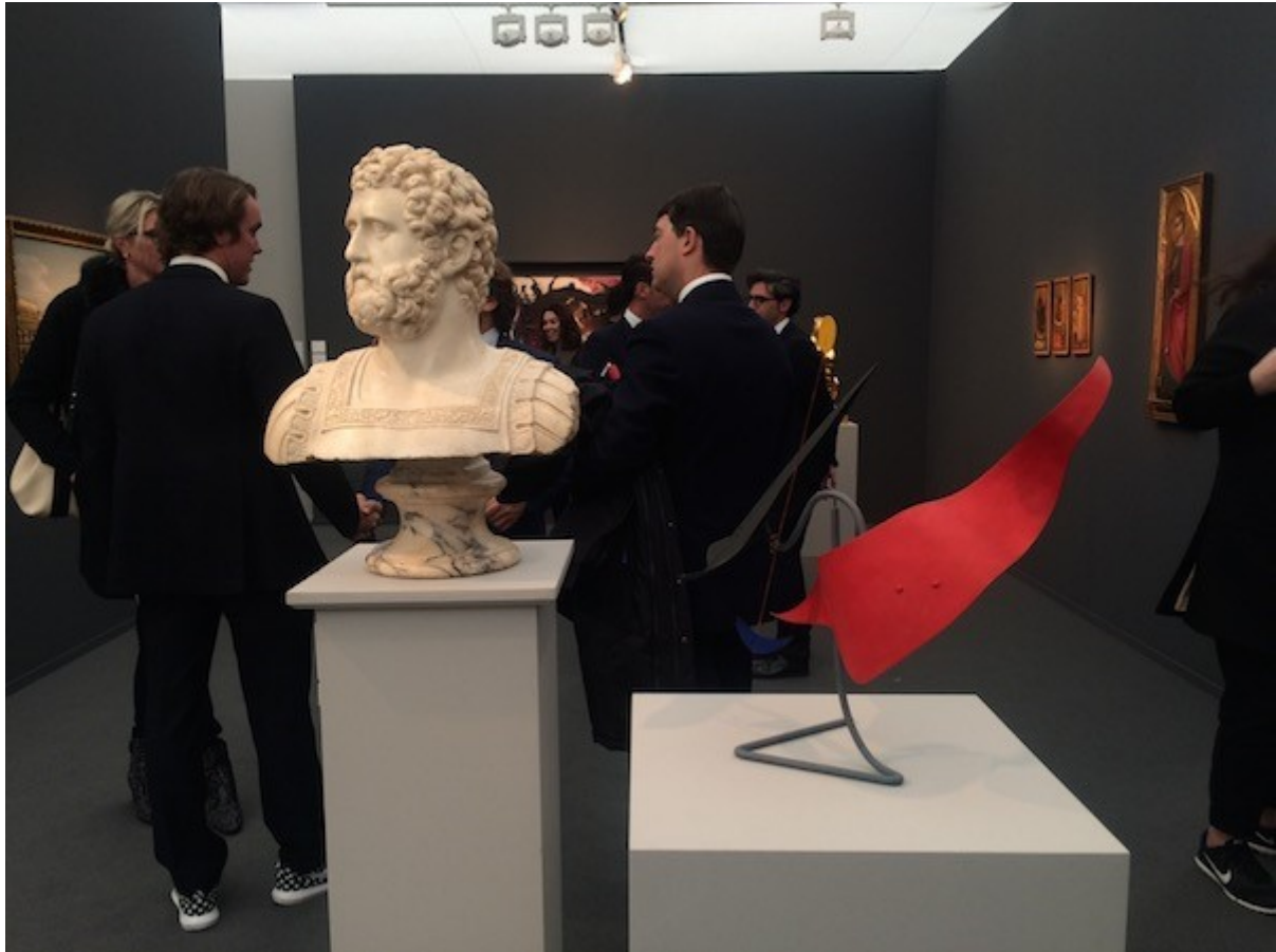
Installation view of Hauser & Wirth with Moretti Galleria