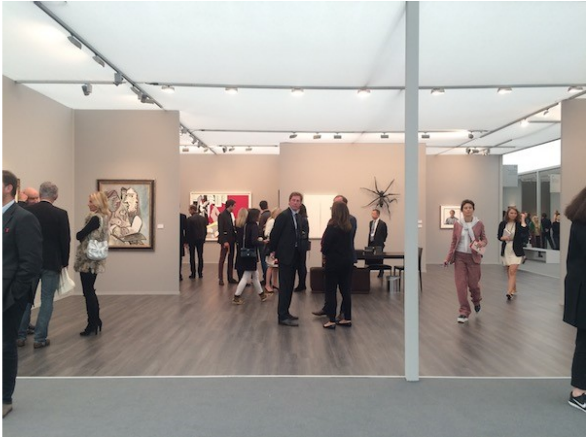
Installation view at Acquavella