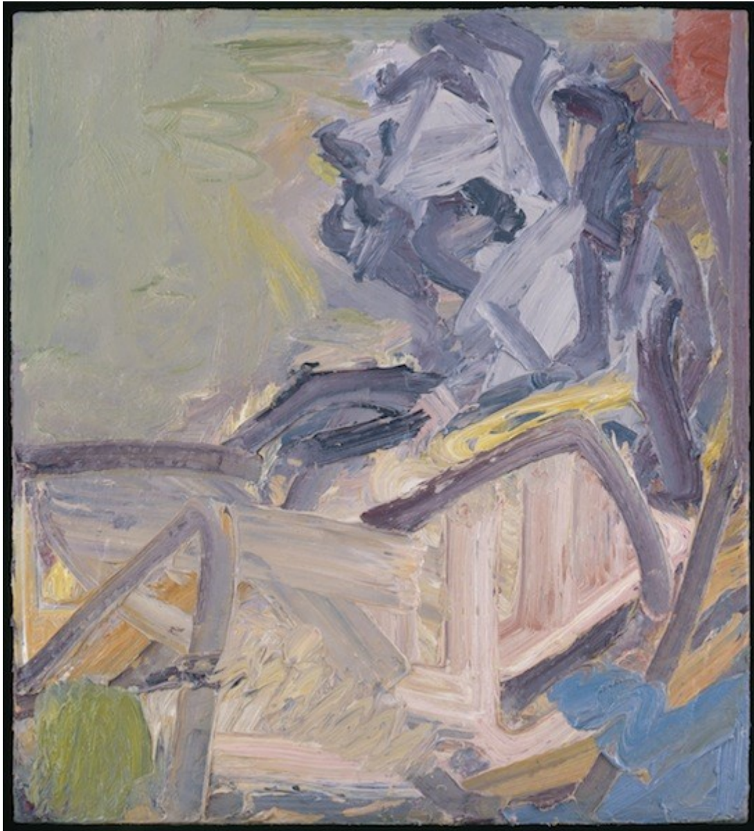
Frank Auerbach J.Y.M Seated II (1996)