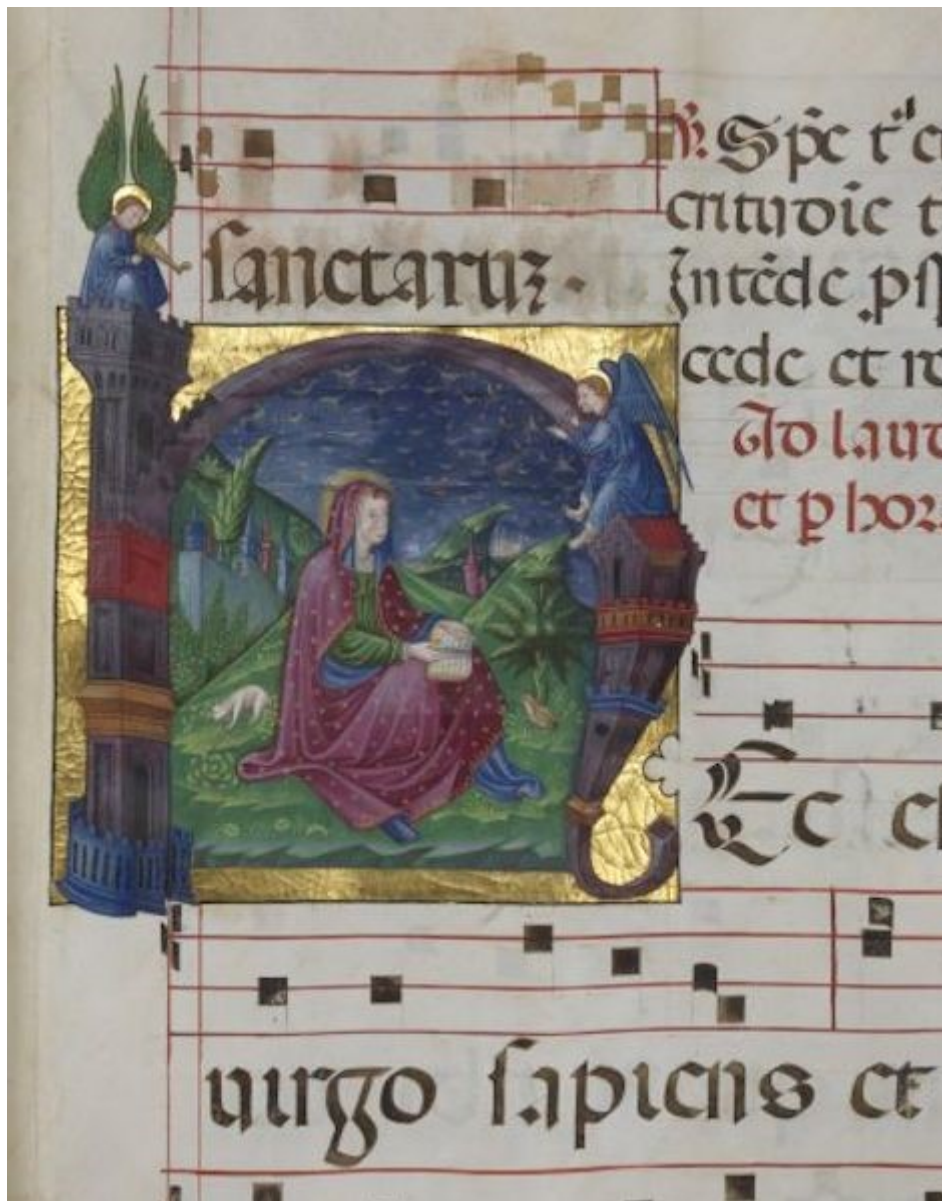
Master of the San Sisto Antiphonals Choir Book of San Sisto (Benedictine Use) (1460-1480)