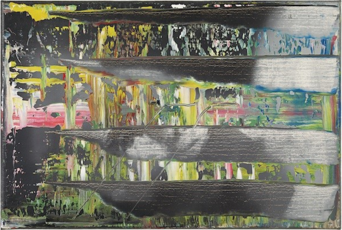
Gerhard Richter Abstraktes Bild (1990)