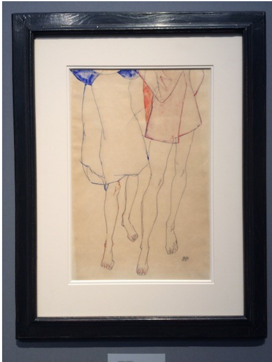
Egon Schiele at Wienerroither & Kohlbacher