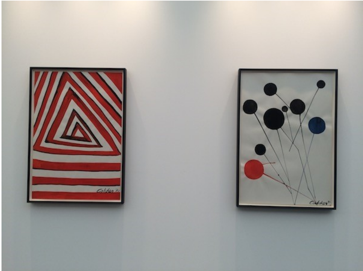
Alexander Calder at Pace. Installation shot at Frieze Masters